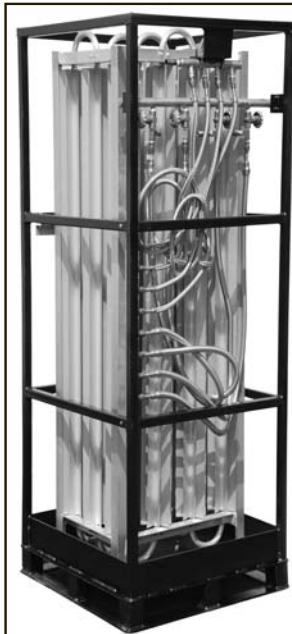
5000 CFH OXYGEN VAPORIZER

Oxygen for burning bar applications can be supplied in a number of different ways. Single high pressure cylinders, high pressure banks, and tube trailers. SINGLE LIQUID OXYGEN TANKS OR DEWARS CAN NOT BE USED.