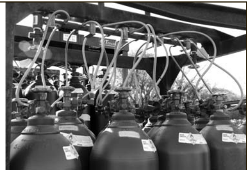
HIGH PRESSURE OXYGEN BANK

SINGLE LIQUID OXYGEN CYLINDERS CAN NOT BE USED FOR BURNING BARS